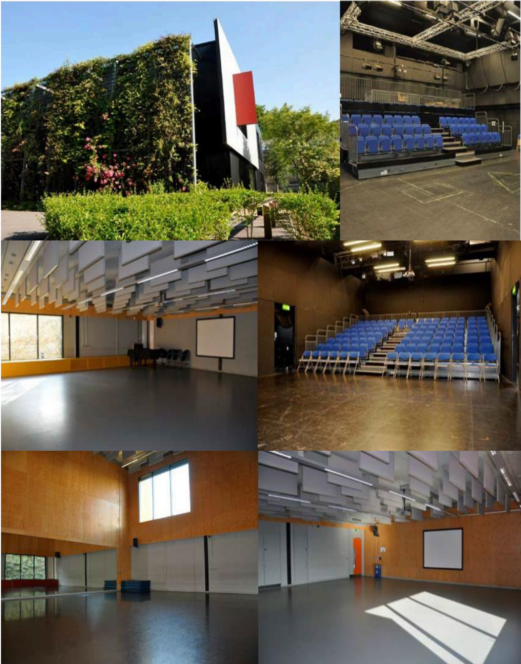
Some of our award winning performance spaces and rehearsal studios