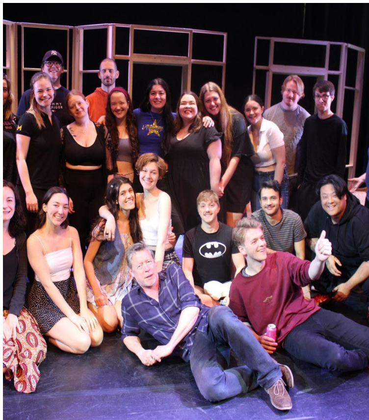
BA Acting Students working at the Theatre Royal Winchester