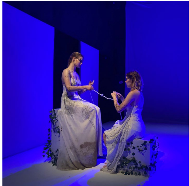
Students rehearsing for 'Everything is Fine', a devised work about ecology and 'big oil'